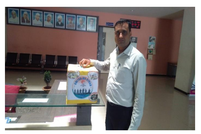
Staff of the department contributing the fund

The institute in collaboration with Sapkal Knowledge Trust, Nashik runs "United we stand" Trust, which works for the welfare of physically challenged Indian army soldiers. The faculty members and students of the institute monetarily contributed for this social cause.