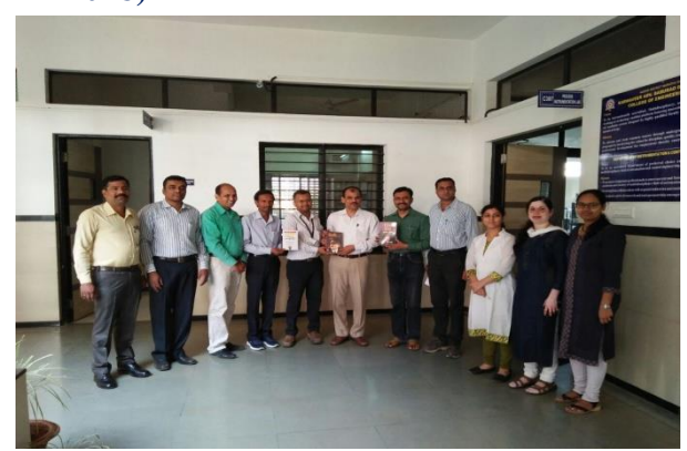
Staff members of the department made book donations to the departmental library

Book Donation by staff members (March 2018)