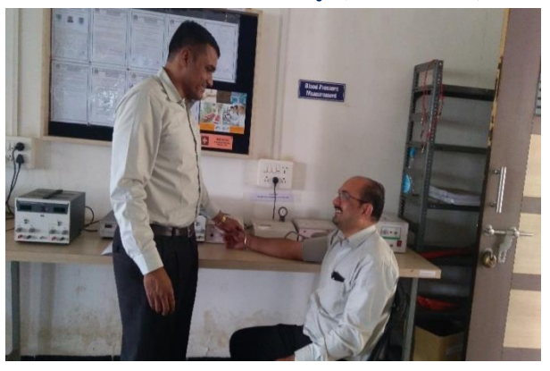
Staff of the institute during the health checkup