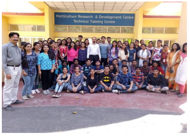
Staff and students of the department during the visit

Reliance Power Plant, Dahanu(20/03/2018)