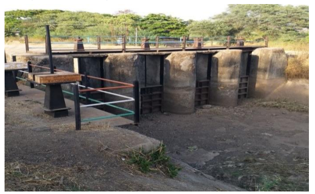
Kadwa canal structure, Igatpuri

Students of BE Civil visited the Kadwa canal structures on 23<sup>rd</sup> March 2018. The main purpose of visit was to study canal structures. The canal has head works and cross drainage works. This canal irrigates areas of Igatpuri and