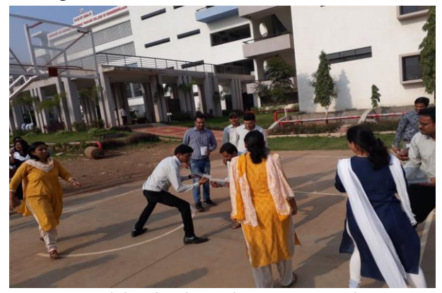
Faculty participating in various games during FDP

Faculty from all the departments of the institute gathered and played various management games to develop some skills like team work, concentration, decision making, leadership, thought process, time management etc.