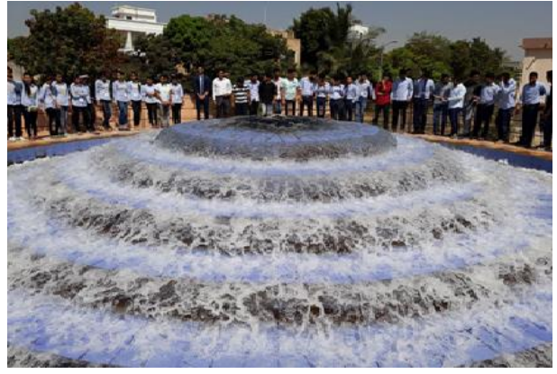
Staff and students of the department during the visit

Department of Civil Engineering organized a visit to water treatment plant on 24<sup>th</sup> March 2018 for TE Civil students. The main purpose of visit was to show various components of water treatment plant, processes involved in the operation of the plant and back washing system in sand filters. Mr. S. A. Suryawanshi guided students during this visit.