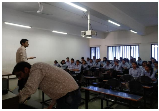
Expert interacting with students during the seminar

Department of Electronics and Telecommunication Engineering organized a seminar on Study Abroad on 28<sup>th</sup> March 2018. The faculty members from Akshay Study Abroad academy guided the aspiring students in planning the entire process properly along with the guidance on entrance tests such as GRE, GMAT, SAT, TOEFL, IELTS, etc.