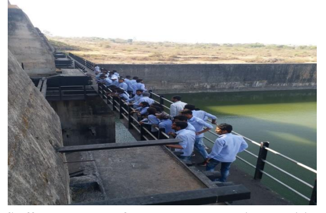
Staff and students of the department during the visit

Department of Civil Engineering arranged a visit to Kadwa Dam at Pimpalgaon Durka, Igatpuri, Nashik. The main purpose of visit was to study this earthen dam. The dam has specifications such as catchment area about 173.23 Km², total length 1429.20 meter, height 31.84 meters, spillway located at centre of dam etc. This dam site was visited by 76 students of final year along with faculty members.