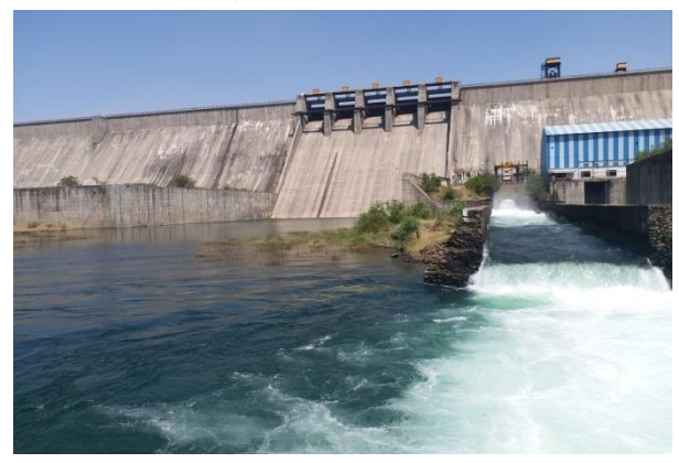
Nilwande Gravity Dam, Akole

Nilwande Dam, Akole, Ahmednagar (23/03/2018)