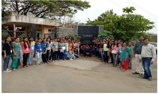
Staff and students of the department during the visit

Department of Electronics and Telecommunication Engineering organized an industrial visit at GMRT Pune on 16<sup>th</sup> March 2018. The Giant Metrewave Radio Telescope (GMRT), located near Pune in India, is an array of thirty fully steerable parabolic radio telescopes of 45 meter diameter, observing at meter wavelengths. It is operated by the National Centre for Radio Astrophysics, a part of the Tata Institute of Fundamental Research, Mumbai. At the time it was built, it was the world's largest interferometric array offering a baseline of up to 25 kilometers.