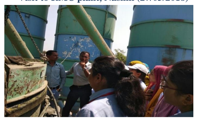
Staff and students of the department during the visit

Department of Civil Engineering organized a visit for SE Civil students to RMC plant located at Viridian Valley, a project by Suyojit