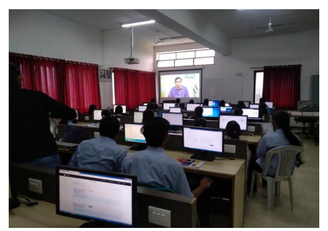
Participants during the hands on session of the workshop