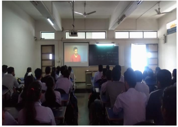
Staff and students of the department during the program

World Youth Skill Day Celebration (16/07/2018)