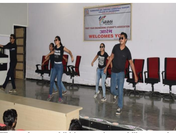
\begin{tabular}{lll} FE & students & exhibiting & various & skills & on & the \\ concluding & day & & & \\ \end{tabular}