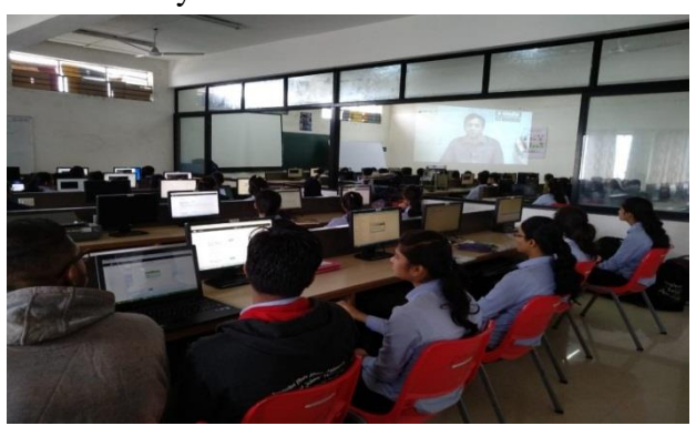
Participants during the hands on session of the workshop