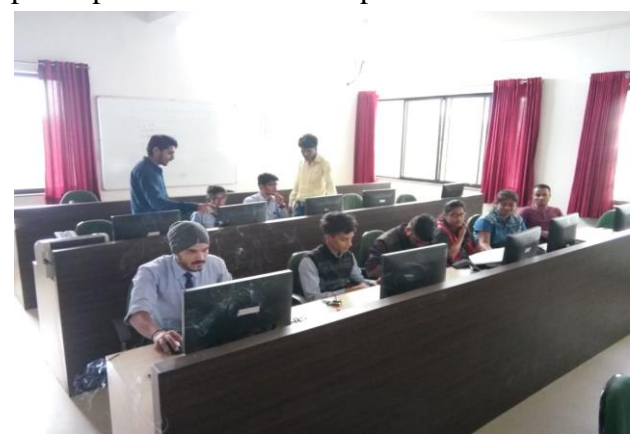
Participants during the hands on session of the workshop

Control & Mechanical engineering department participated in the workshop.