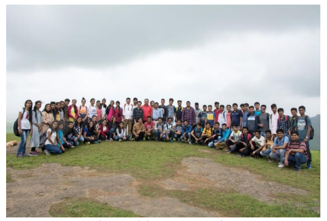
FE students during a visit to Ramshej Fort