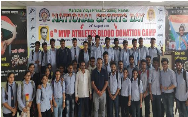
Participants of blood donation camp

Dr. Vasanttrao Pawar Medical College, Adgaon, Nashik on 29 th August 2018.