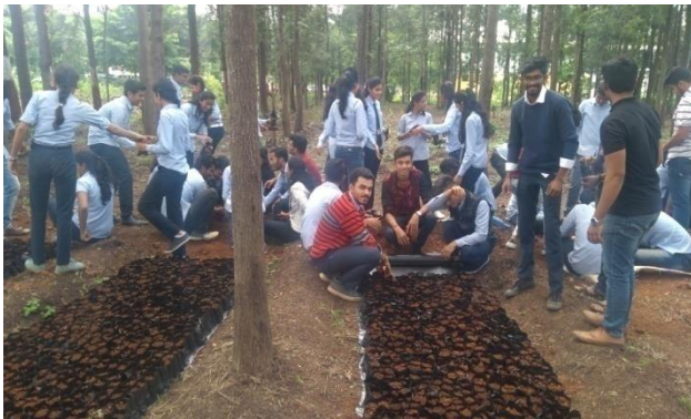
Staff & students of the department during the visit

All students and staff members of the department visited agriculture farm of MVP's Agriculture College and performed various farm activities on 31 st August 2018.