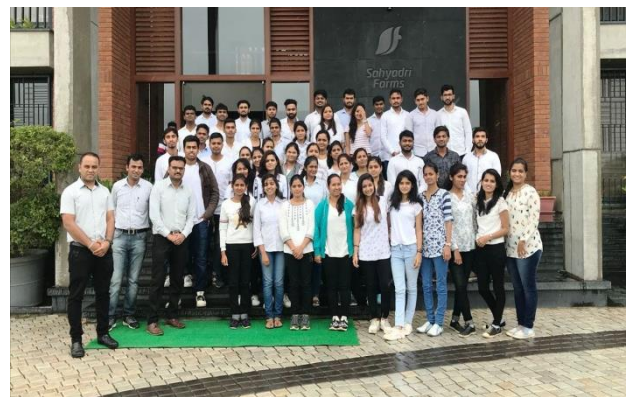
Staff & Students of the department during the visit

With an objective of providing the practical insights in to the food processing and manufacturing practices, the Department of MBA organized an industrial visit to Sahyadri Farmers Producer Company at Mohadi, Nashik on 21 st August 2018.