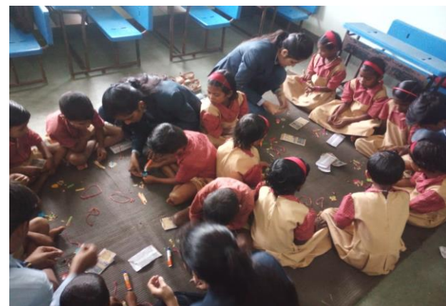
MBA students carried out various activities for school children

The second year students of MBA department visited Rajewadi village under the Village Adoption program on 4 th August 2018. During this visit, the student designed and carried out various activities such as Raakhi making workshop for the school students at Rajewadi. The MBA students also demonstrated the importance of sanitation, hygiene and financial planning to the villagers.