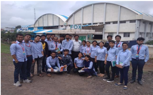
Staff & Students of the department during the visit

Department of Electronics & Telecommunication Engineering organized an industrial visit to Fox Solutions, Vilholi, Nashik on 19 th August 2019. The students of third year took the benefit of the visit.