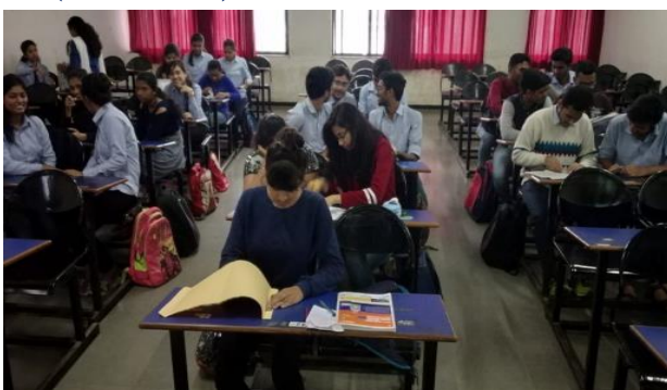
Students during the paper bag workshop

Department of Information Technology organized paper bag making workshop on 20 th August 2018.