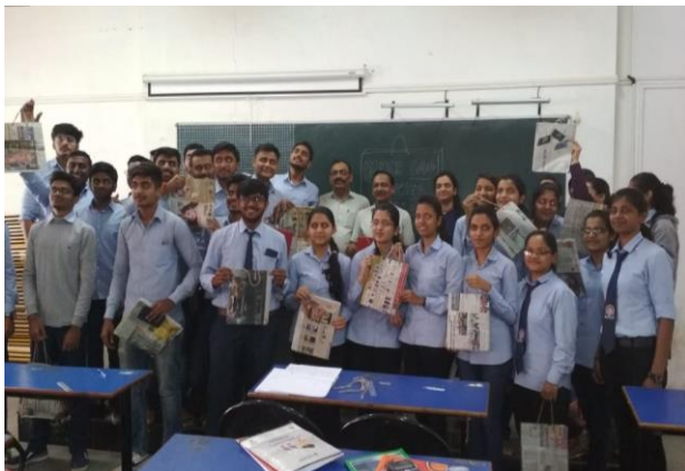
Students & staff during the paper bag workshop

The department of Civil engineering organized a workshop on Paper Bag making on 30 th August 2018.