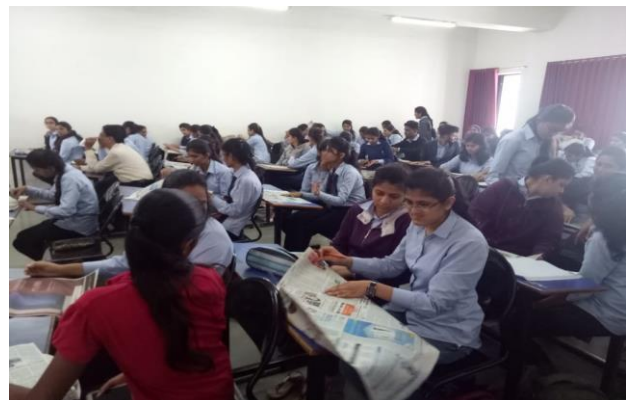
Students during the paper bag workshop