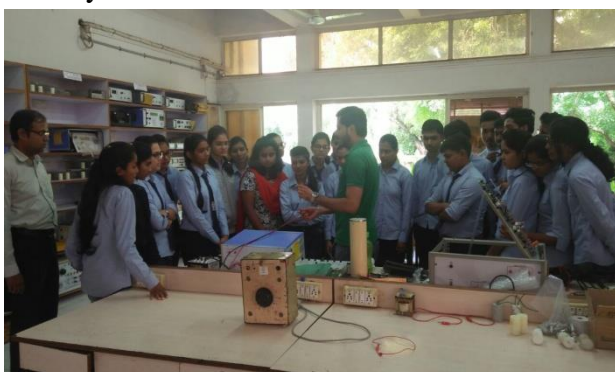
Staff & Students of the department during the visit

Department of Computer Engineering organized an Industrial visit for the second year students at Sivanand Electronics, Nashik. Sivanand Electronics is specialized in the manufacturing of Test & measuring Instruments, Metal Detectors, Turnstiles, Perimeter security systems. Students observed the demonstrations of Oil testing hardware, security hardware like metal detector and security entrance.