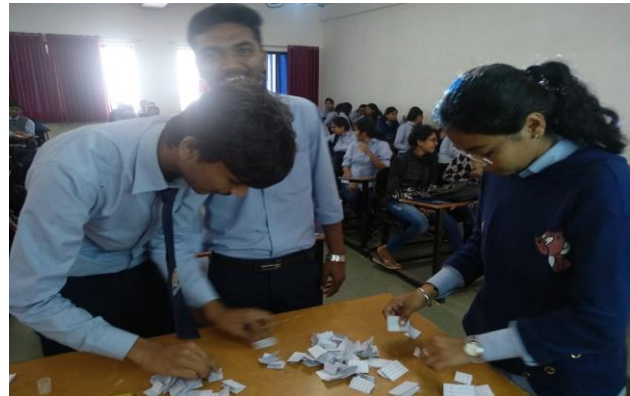
Student representatives during the event