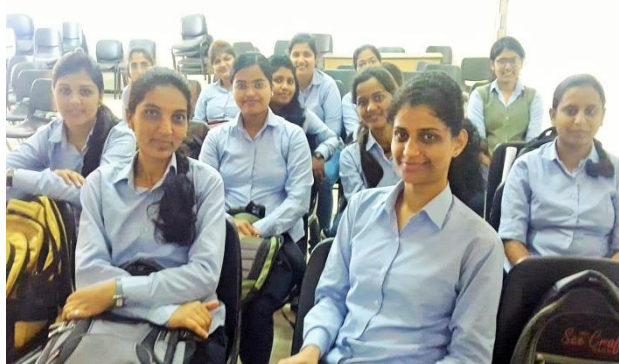
Students during the training program

Barclay as a global organization offers training around the world and careers that are both challenging and rewarding. 03-days Barclay's training was organized during 23 rd to 25 th August 2018 to foster and improve leadership qualities in students. The students of the final year took the benefit of the program.