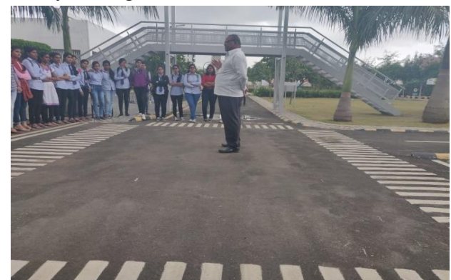
Students of the department during the visit

Department of Electronics & Telecommunication Engineering organized a visit to "Traffic Park" Nashik on 25 th August 2018 for the second year students. The activity was conducted under Audit Course-1 of Road Safety Management.