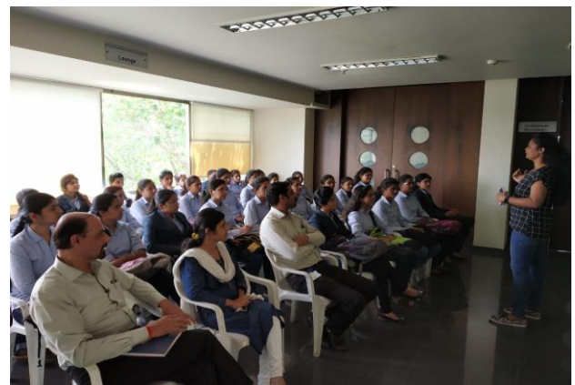
Staff & Students of the department during the visit

Department of Electronics & Telecommunication Engineering organized an industrial visit to ESDS Software Solutions Pvt. Ltd., Nashik on 31 st August 2018. The students were guided on Computer Networking & Security. Students of the final year took the benefit of the visit.