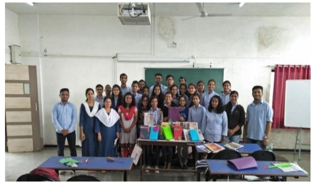
Students & staff during the paper bag workshop