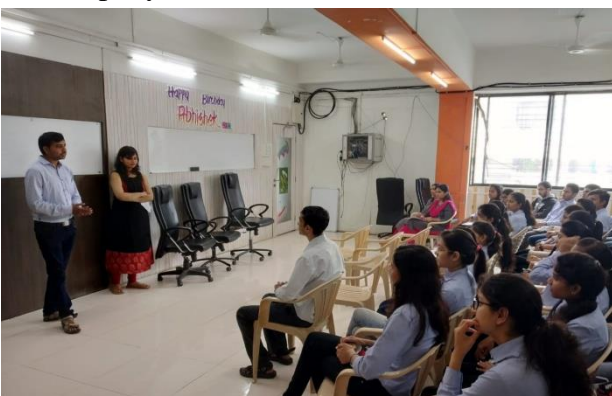
Staff & Students of the department during the visit