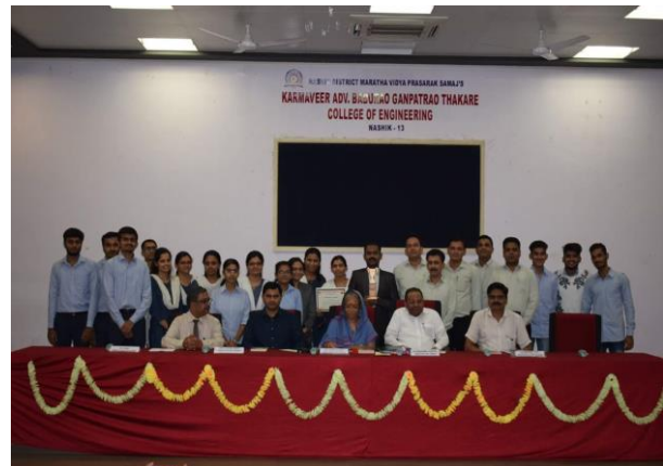
Dignitaries, staff and students of the IT department during the award function