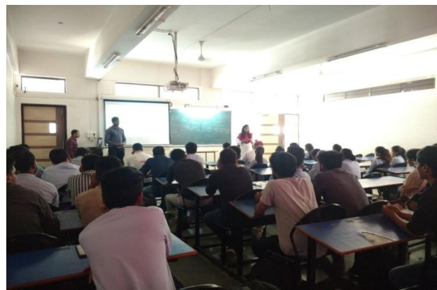
Experts interacting with students during the training session

cum training session on 31 st August 2018. In this session students were guided on Revit Architecture (Basics) and Revit MEP. The students and staff members of the department took the benefit of the session.