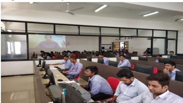
Students during the workshop