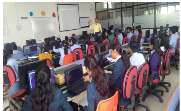
Hands on session during workshop