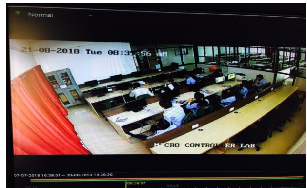
Online demo of MapuSoft