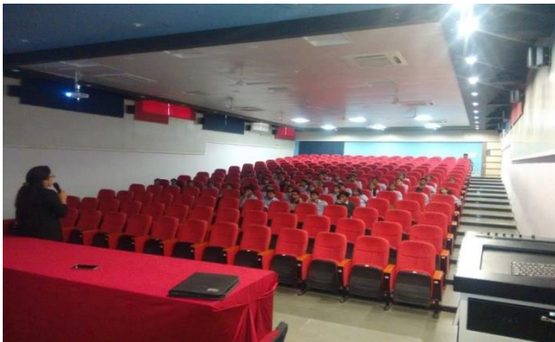
Expert & Students during the session

on topics such as, opportunities abroad, top universities abroad, GRE, IELTS, TOFEL coaching, German language coaching etc. The students and staff members of the department took the benefit of the session.