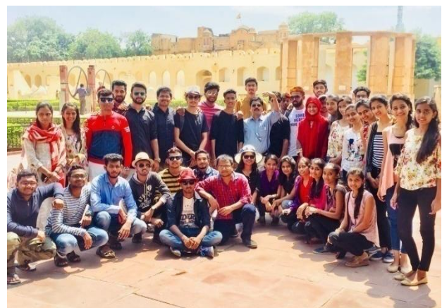
Staff and students of the department during visit to Jantar-Mantar, Jaipur