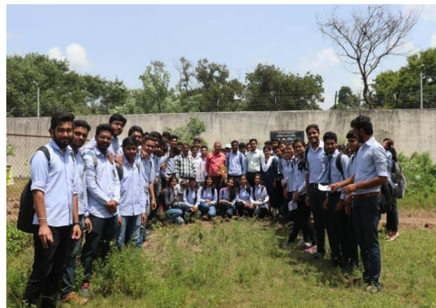
Staff and students of the department during visit to Meteorological Station