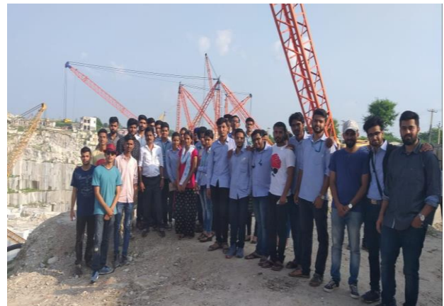
Staff and students of the department during visit to Marble Mine, Sawar (Jaipur)

to observe and understand mining activities, to study historical planning, architecture, structures, construction techniques and material, WTP and to study the green building concept implemented at Fort, Jantar-Mantaretc. In this visit, the students visited various locations in Rajasthan state like Chittaurgarh Fort, Udaipur (Palace, lakes, saheliyonki Bari etc), Pushkar, Jaipur (Amer Fort, Pink city, Jantar-Mantar, Hawa-Mahal, Museum, Birla Temple etc), Bisalpur dam (Geology: rock types, structures), WTP at Bisalpur colony, Sawar (Marble mine). Final year students of the department took the benefit of the visit