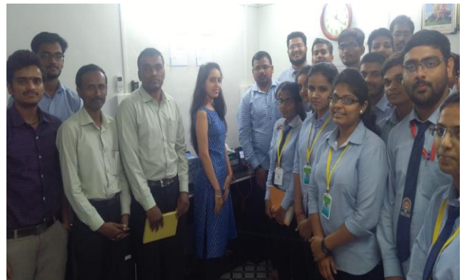
Students during the visit to Samarth KrupaInstru. Lab., Nashik