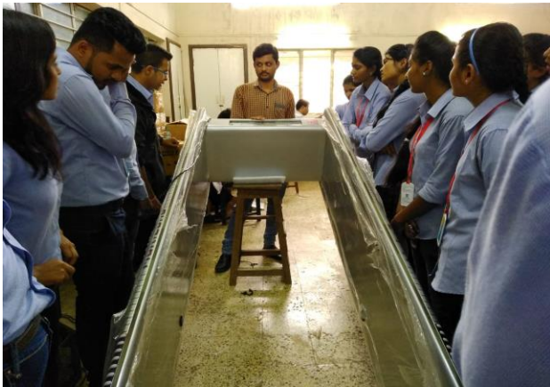
Students observing the processes during the visit