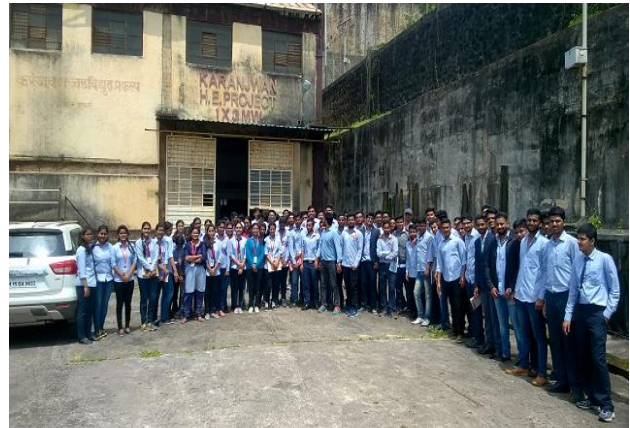
Staff and students of the department during visit to Karanjwan Hydropower Station, Dindori

Third year students of the Mechanical Engineering department visited Karanjwan Hydropower station, Dindori for the practical knowledge of Turbo-machines subject. During the visit, Students observed the dam site, the penstock used for the turbine, the working of Francis turbine and the electric generator. Students also learned the functioning of Francis turbine using servomotors connected to the guide vanes.