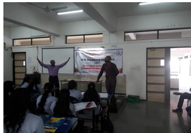
Experts interacting with students during the session