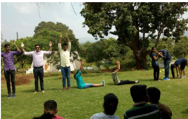
Students during training session