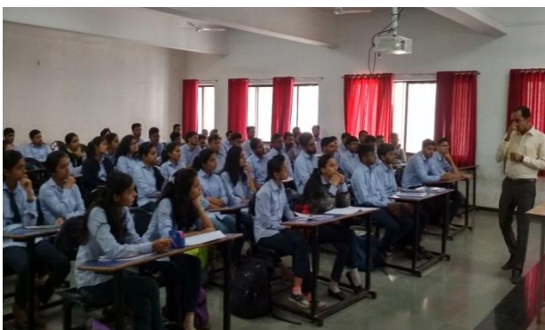
Experts from TIME, guiding the students

Time Institute, Nashik conducted a seminar on “Management as a Career” for TE-Civil students on 10 th September 2018. The experts from Time Institute explained the importance of pursuing post-graduation courses in management after engineering. The scope of management in shaping successful career was also elaborated in this lecture.