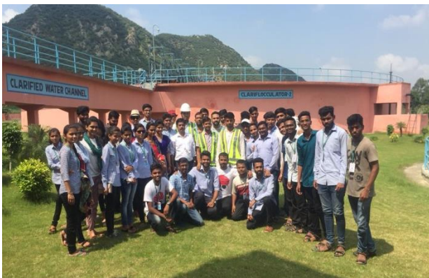
Staff and students of the department during visit to Bislapur Dam and Water Treatment Plant