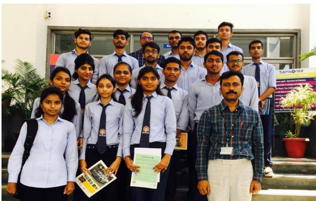
Staff and students of the department during visit to Samsonite South Asia Pvt. Ltd., Nashik