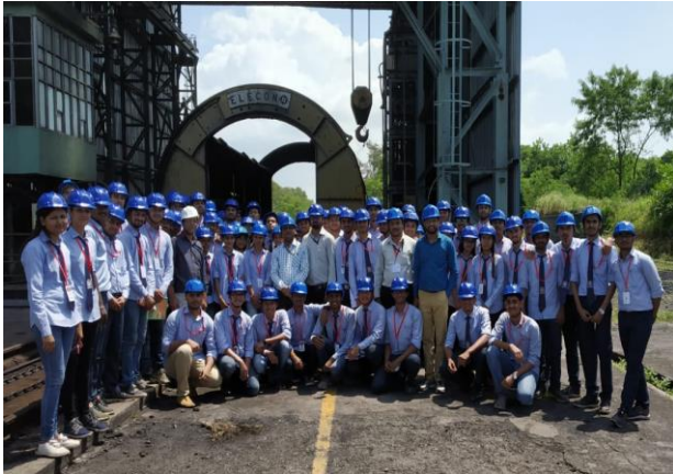
Staff and students of the department during visit to Thermal Power Plant, Dahanu

Second year Mechanical Engineering students visited Thermal Power Plant at Dahanu as a part of term work of Thermodynamics subject on 18 th & 25 th September 2018. During the visit students observed various aspects of thermal power plant, working of boiler, maintenance and operating aspects of power plant.