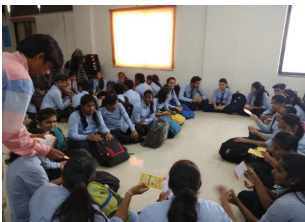
Students guiding the participants during the workshop

The ED Cell of the institute organized a one day Raakhi Making workshop for the students of engineering. Department of MBA has been conducting Project Bandhan since 2013. The students of second year MBA who worked for Project Bandhan this year guided the participants of the workshop in crafting beautiful Raakhi with the help of DIY Raakhi Kit.