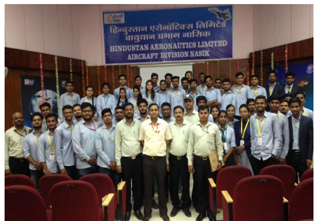
Staff and students of the department during visit to HAL, Ozar, Nashik

Final year students of the department visited, HAL Ozar, Nashik to gain practical knowledge of Dynamics of Machinery subject. Practical aspects of vibration in air craft engines and CNC Machines were observed by students. Students also observed various overhauling, maintenance, assembly of Aircraft and manufacturing processes of various components of Aircraft.