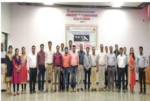
Staff members of Civil Engineering department on occasion of Teacher's Day