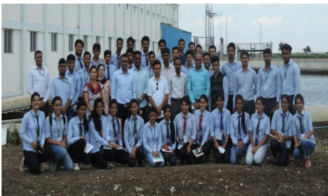
Staff and students of the department during visit to Jain Irrigation, Hungund, Karnataka