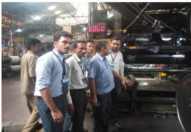
Staff members of the department during the visit to CEAT Ltd., Nashik