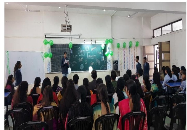
Students and Staff members of IT department during Teacher's Day Celebration