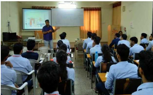
Students during the visit to Nasik Thermal Power Station, Nashik