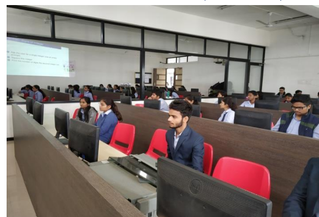
Hands on session of students during the workshop

Department of Information Technology organized three Days workshop on "Basics of Python" conducted by FOSSEE IIT BOMBAY during 6 th to 8 th September 2018 for TE-IT