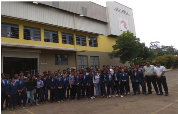
Staff and students of the department during visit to Reliable Automotive Pvt. Ltd.