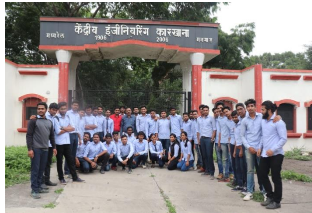
Staff and students of the department during visit to Central Engineering Workshop