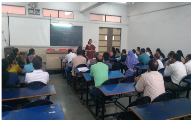
Instrumentation & Control Engineering department organized a session "Saksham" for the parents