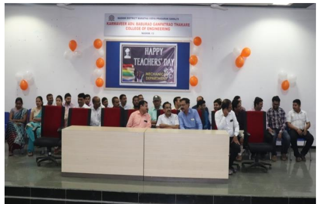
Staff members of Mechanical Engineering department on occasion of Teacher's Day