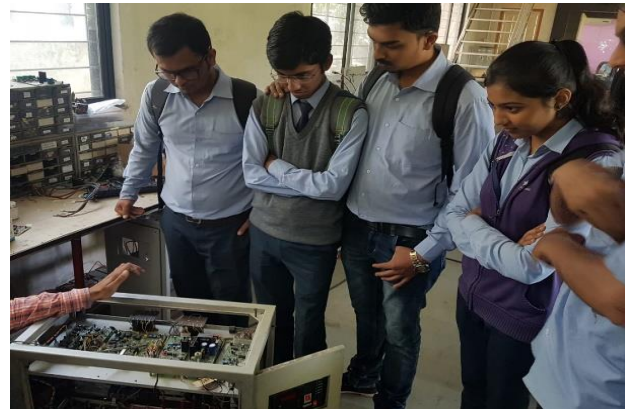
Students observing the processes during the visit

exposed to various practices of electronics industry during the visit.