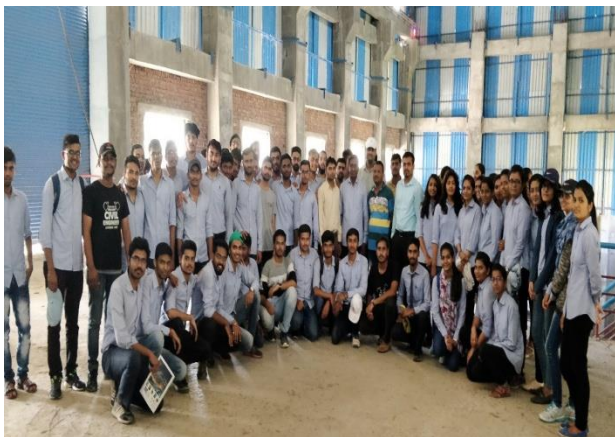
Staff and students of the department during visit to Nilwande Dam Hydropower Station

Department of Civil Engineering organized a visit to Nilwande Dam and Hydropower Station on 11 th September 2018. The students observed the Kaplan turbine used in this plant which rotates vertically with a capacity of 8 MW. Third year students of the department took the benefit of this visit.