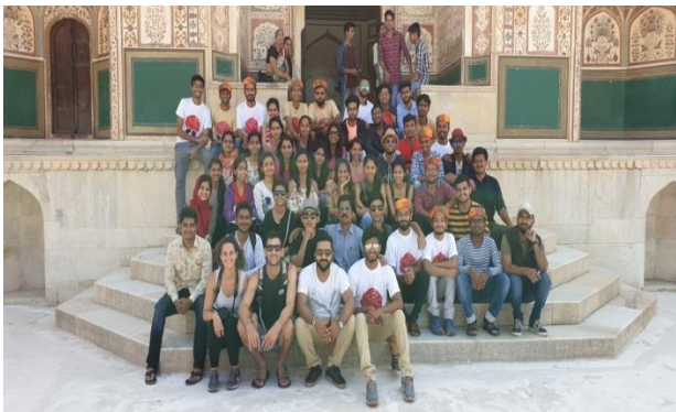
Staff and students of the department during visit to Amer Fort, Jaipur