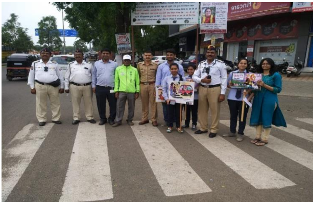
Student, Staff members, Civilians and Police officials during the activity

and other staff of Maharashtra Police, E&TC's PAES students of SE, TE and BE demonstrated Road Safety Management to citizens of Nashik at Gangapur Naka and Jehan Circle. During this event students also created awareness regarding traffic rules and road safety measures.