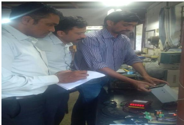
Staff members of the department during the visit to Orion Electronics, Ambad, Nashik