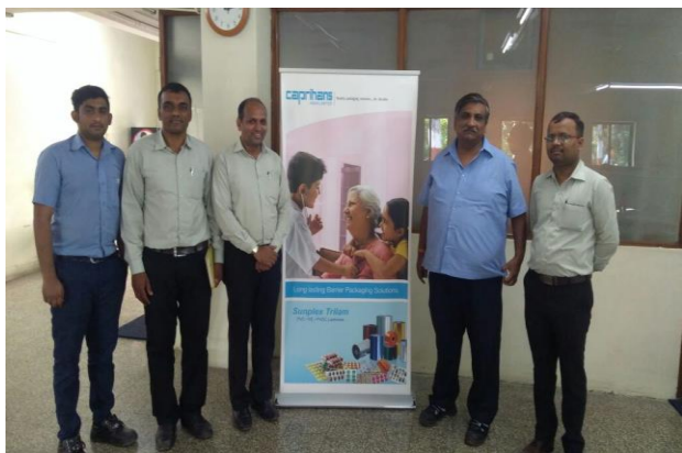
Staff members of the department during the visit to Caprihans India Ltd., Nashik