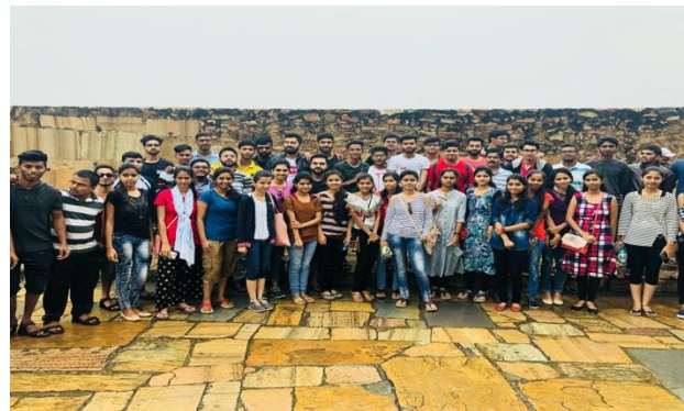
Staff and students of the department during visit to Chittor Fort