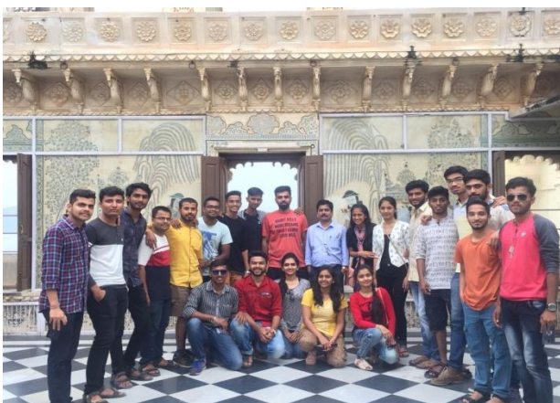
Staff and students of the department during visit to Udaypur City Palace

Third year Civil Engineering students visited Meteorological Station, Indira Nagar, Nashikroad on 7 th September 2018. The students got the opportunity to observe different weather parameters (Anemometer, Automatic recording rain gauge station-float type, Dry and Wet thermometer, maximum and minimum thermometer, etc.) and working process at this station.