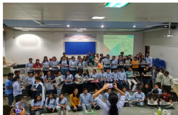
Students and staff members of the department during the activity