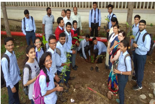
Students and staff members of the department during the activity

Staff Members and students of Instrumentation & Control engineering department planted trees in the campus of Institute on 15 th September 2018.