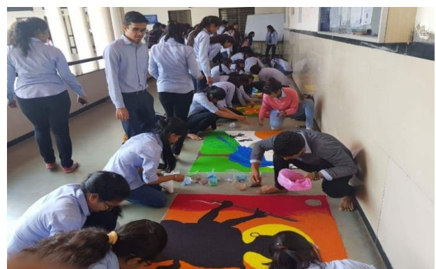
Students participating in Rangoli competition

On occasion of Ganpati Festival during 13 th to 22 nd September 2018, Information Technology Student Association (ITSA) organized various competitions such as Rangoli competition, On the spot PPT, Technical quiz, Innovata, Battle Grounds etc for the students. The students with remarkable performances were awarded with certificates and prizes.