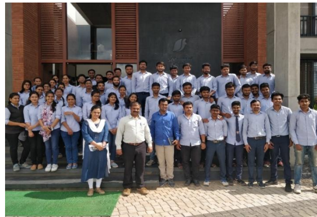
Staff and students of the department during visit to Sahyadri Farms, Mohadi, Nashik