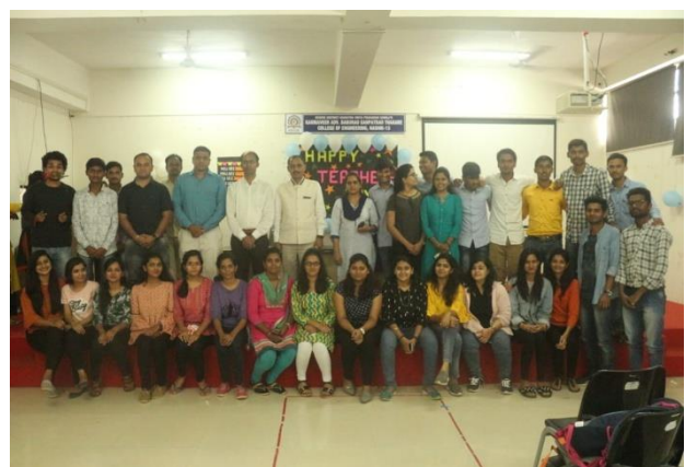
Staff members and students of MBA department on occasion of Teacher's Day