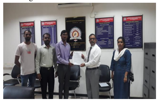
Dignitaries during the signing of MoU

Department of Information Technology signed MoU with "Arete Technology". Arete Technology was established in 2013 by young and passionate professionals in Nashik, Maharashtra. Arete Technology provides simple, logical and innovative solutions to common business and technical problems, executing cost effective solutions.