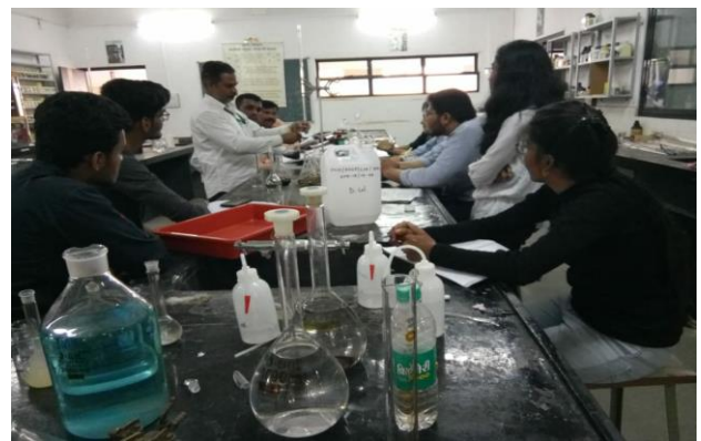
Staff & Students of the department during the visit to MVP's KDSP College of Agriculture