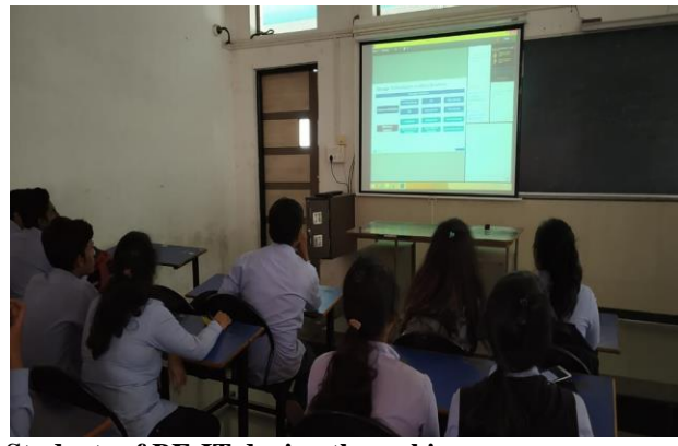
Students of BE-IT during the webinar

Webinar by AWS and Dell EMC (11/10/2018)