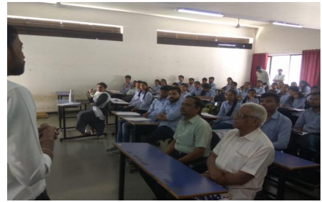
Volunteers of Jalsamruddhi Abhiyan guiding the audience

Students of Civil Engineering were guided for save water movement by Volunteers of Jalsamruddhi Abhiyan, Nashik. Volunteers of this organization provided brief information of their mission and appealed students and staff of the department to participate in this program.