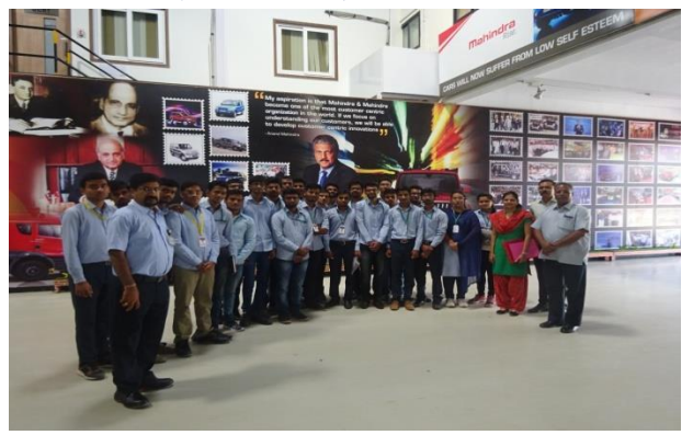
Staff & Students of the department during the visit to Mahindra & Mahindra

Mahindra & Mahindra Ltd, Satpur, Nashik (10/10/2018)