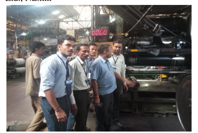
Staff & Students of the department during the visit to CEAT Ltd.

The department also organized a visit to Fox Solutions Pvt. Ltd. Nashik on 7<sup>th</sup> & 8<sup>th</sup> October 2018 for ATC Training students. Students observed DC Drive and panel components during the visit. With an objective to enhance Industry-Institute Interaction, the department also organized a visit to CEAT Ltd., Nashik