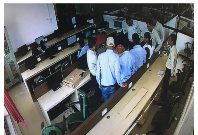
Staff & Students of the department during the demonstration