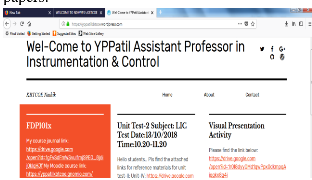
Web-portal for unit test

websites. He also conducted Unit test –II (PDC) for BE students using ICT facilities available in the class room instead of printing question papers as a practice to reduce use of papers.