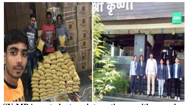
SY-MBA students interacting with various entrepreneurs

With intent to inculcate entrepreneurial skills and explore the word of employment, Department of MBA organized an Entrepreneurial Development competition, "Jugaad-2018" during the month of September-October 2018. In this competition, the students from SY MBA divided in to 10 groups and interviewed various entrepreneurs in Nashik city. They also took part in their business operations, thereby leaning the knack of businesses. The presentations of these activities were carried out in the first week of October-2018.