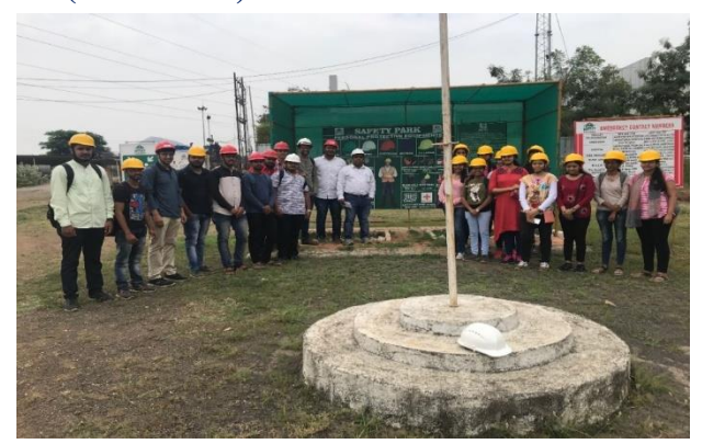
Staff & Students of the department during the visit to EKA Project

■ EKA project by Amit Enterprizes (29/09/2018)