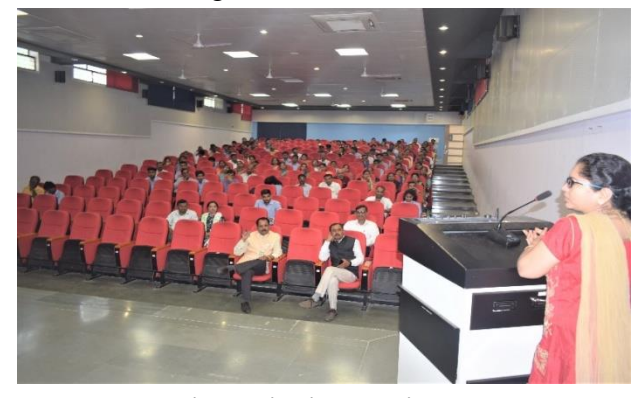
Parents expressing their views during the meet

Department of Engineering science organized a Parent-Teacher Meet on 20<sup>th</sup> October 2018. The topics such as student attendance, Online Examinations, Result analysis, student performance etc. were discussed during the meet.