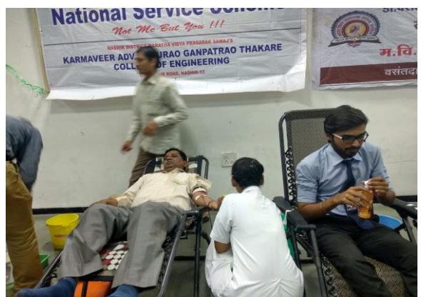
Staff & Students of the institute during the camp

NSS unit of the institute organized a blood donation camp on 3<sup>rd</sup> October 2018. Students and staff members of the institute donated blood on this occasion.