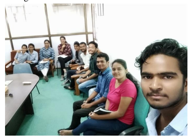
Students of the department during the visit to Fox Solutions Pvt. Ltd.

panel manufacturing and Laser cutting machine during the visit.