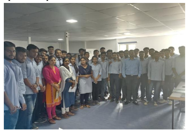
Staff & Students of the department during the visit to Stramma Summit Nashik

Third year students of the Mechanical Engineering department visited Stramma Summit, Nashik on 8<sup>th</sup> October 2018 for the practical subject knowledge of Metrology and Quality Control. During the visit, students observed various digital measuring Instruments and instrument required for calibration. Students also learnt the Manufacturing of Special Purpose Machine.