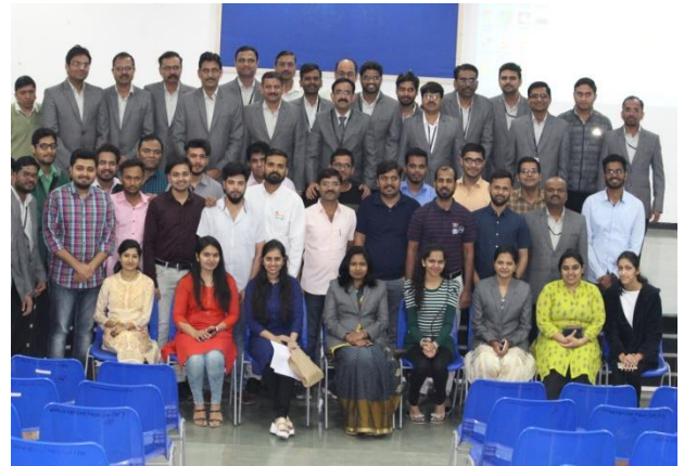
Department of Mechanical Engineering