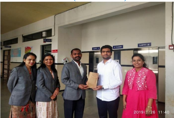
Department of Information Technology