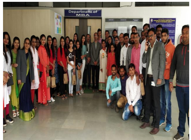
Department of MBA