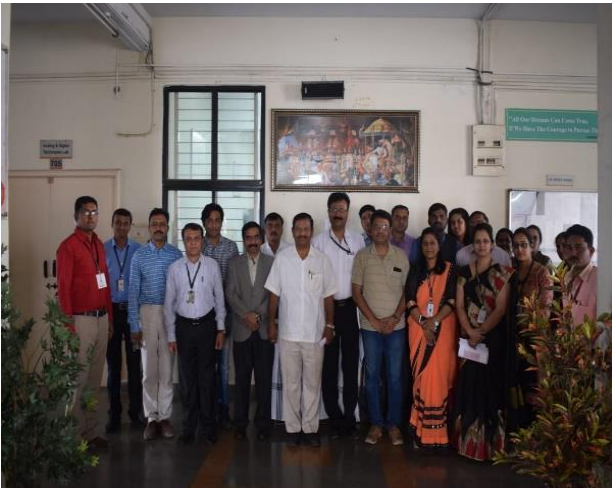
One day workshop on “Syllabus Discussion and Implementation on Process Instrumentation”