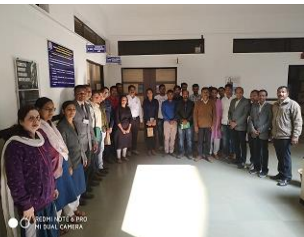
Department of Instrumentation & Control Engineering