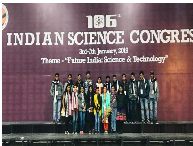
Students participated in 106 th Conference organized by Indian science congress Association at Lovely Professional University, Pharwara, Jalandhar