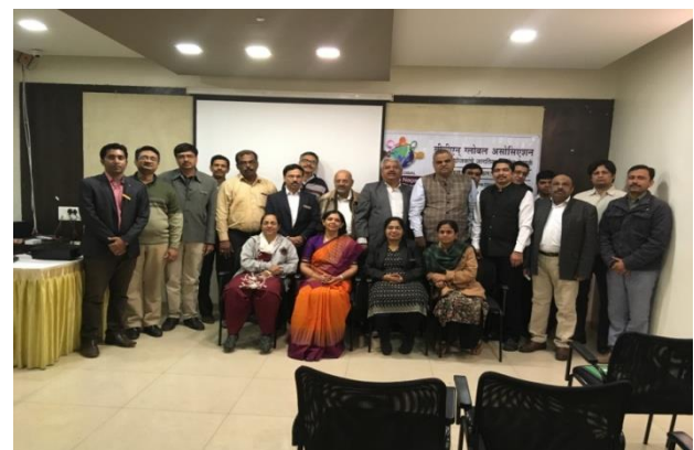
Unfolding Self and Organizational Potential