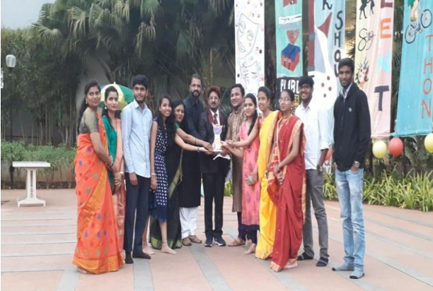
Students of TE-Civil participated in NUKKAD drama competition held at MET BKC, NASHIK on 16 th January 2019. The team won the 2 nd Prize.