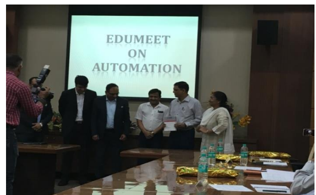
Edumeet on Automation at IIT Bombay