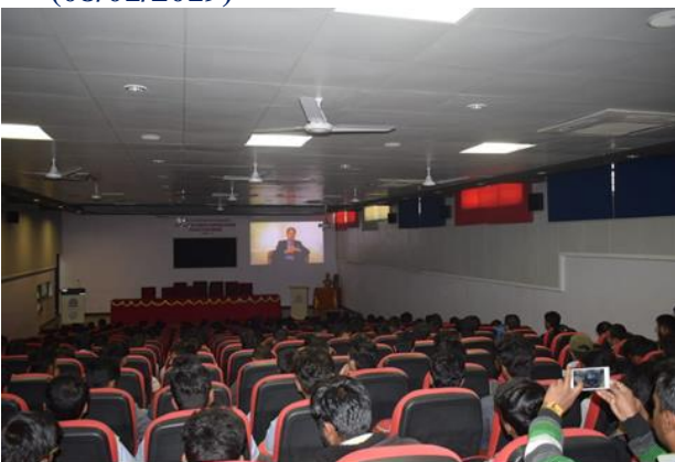
A Live session (Webinar) is organized for “India First Leadership Talk Series” by Mr. Anand Mahindra (Chairman, Mahindra Group) on 8 th January 2019 as a part of IIC (Institution’s Innovation Council) under MHRD’s Innovation Cell (MIC).