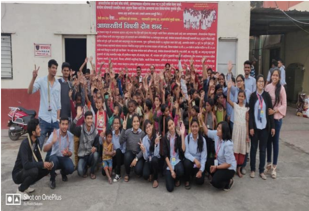
PAES-E&TC along with its staff visited Adhartirtha Ashram on 4 th February 2019.