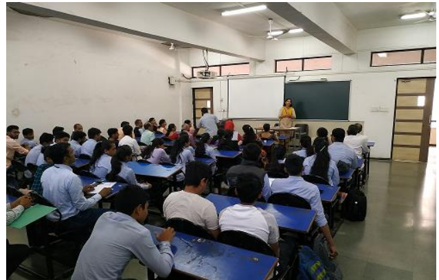
“Women-Centric Families” was the topic of Expert talk in Parents Meet in Department of Instrumentation & Control Engineering on 23 rd February 2019.