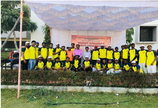
Students of Final year Instrumentation & Control engineering participated in sports events like Cricket, Volleyball & Football in Vasant Karandak 2019.