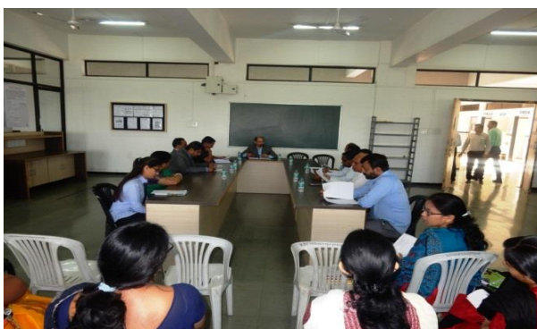
As a part of OBE (outcome based education) & to bridge the gap between industry and institute, a second meeting of Industrial Advisory Board & Stock Holder was held on 23 rd February 2019 to discuss various issues to achieve & implement OBE at Department of Electronics & Telecommunication Engineering.