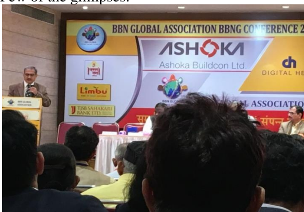
Conference of Entrepreneurs, Thane