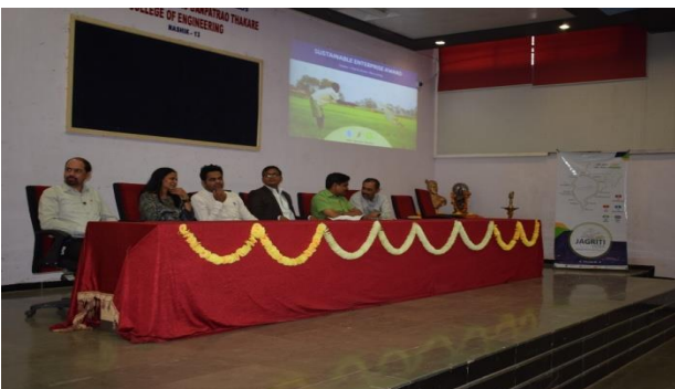
Third Year Instrumentation & Control Engineering students attended value added session on “Creating Awareness on Sustainable Entrepreneurship Award” by Jagriti Yatra on 28 th March 2019.