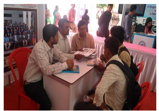
The staff of institute did counseling to 12<sup>th</sup> standard students on admissions to engineering courses at Raosaheb Thorat Hall, in Sakal Eduspire Admission Expo-2019 during 07/06/2019 to 09/06/2019.

Counseling at "Sakal Eduspire Admission Expo-2019(07th to 09th June 2019)