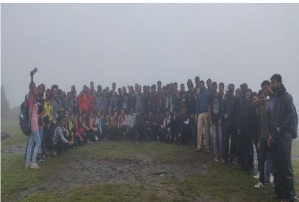
First Year Engineering students and staff members visited “Ramshej Fort” on 16 th August 2019