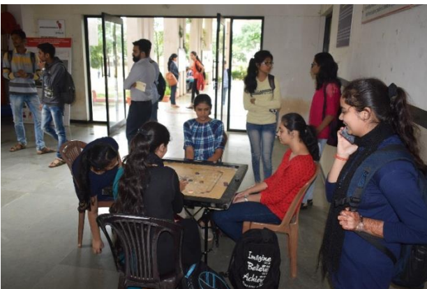
Various sport activities for students were also carried out during the event on 14 th August 2019