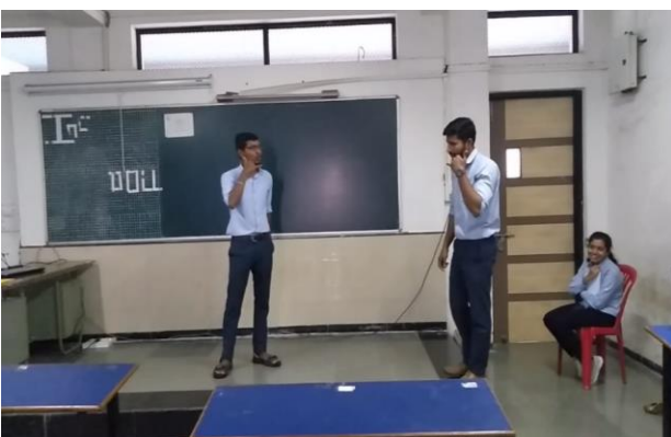
Final year group performing role play on Procurement activities for automation project