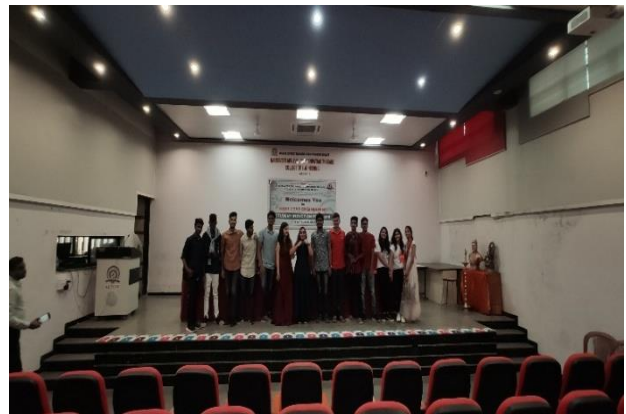
Various Cultural Activities were also carried out for students on 20 th August 2019