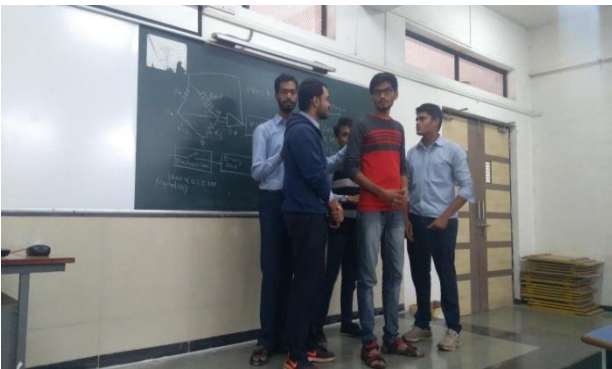
Final year group performing role play on I.C. Engine concept (Four stroke engine)