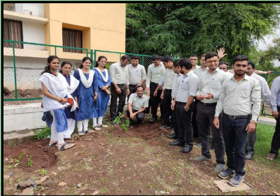
Staff of Civil Engineering Department doing tree plantation