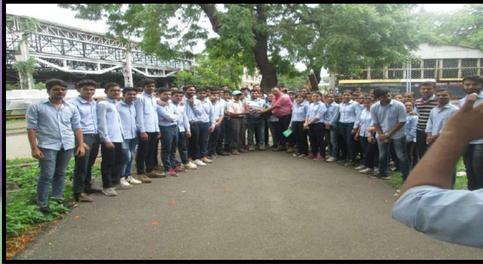
Third year Civil Engineering Students at Central workshop, Manmad