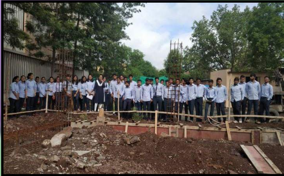
Second year students at robotics lab and horizon school site