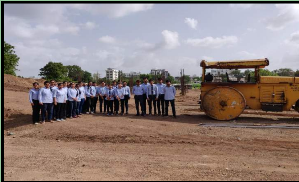
Third year civil students at horizon school site to study construction machinery

The industrial visit was arranged for TE Civil students on 19/06/2019, Wednesday to Horizon academy building site near to the campus. The purpose of the visit was to study and understand the working and use of various construction equipments like concrete mixer, backhoe loader, road roller etc. Mr. Pranav Sonone has guided students during the visit.