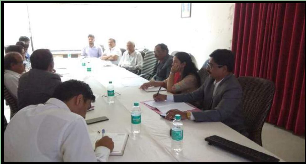
DAB members discussing on various issues.