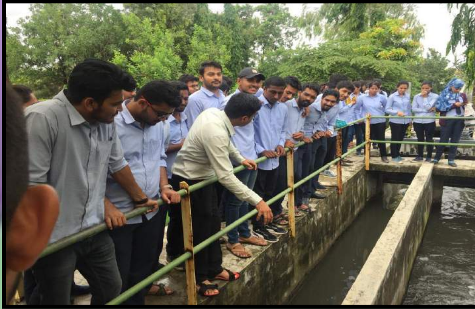
BE Civil students at Wastewater treatment plant