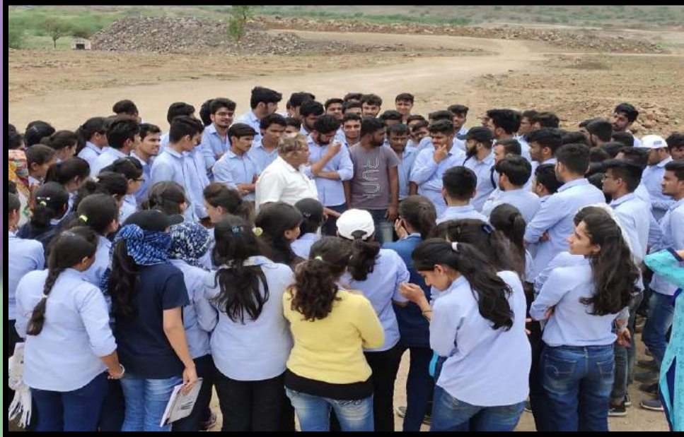
TE Civil and BE Civil students at Dam Site

The visit was arranged for TE Civil and BE Civil students on 11/07/2019, Wednesday to Jamphal Dam. Jamphal Dam is an earthfill dam near Shirpur , Dhule district in the state of Maharashtra , India. The water from Tapi River is lifted up and would be stored in it. The purpose of the ongoing dam is to fulfill the need of irrigation in Dhule district having scarcity of water.